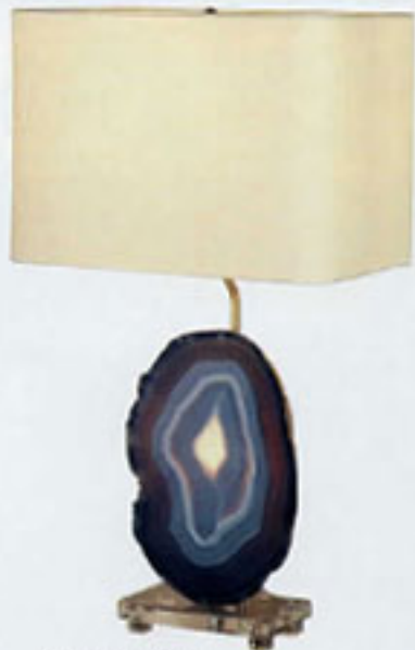
MEREDITH BOHN Brazilian Agate Table Lamp

"This stunning pedestal table represents the ocean, with its gorgeous undulating waves that play across the surface and edges of the table. Made out of ice-blue cast resin and sitting atop a stunning base of silver-leaf metal, it is the perfect setting for a summer meal." Studio 534, Boston Design Center, (617) 345-9900, s5boston.com